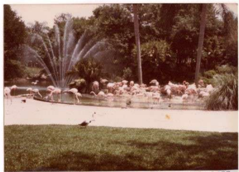
Busch Garden, Tampa, Florida Apr.1977