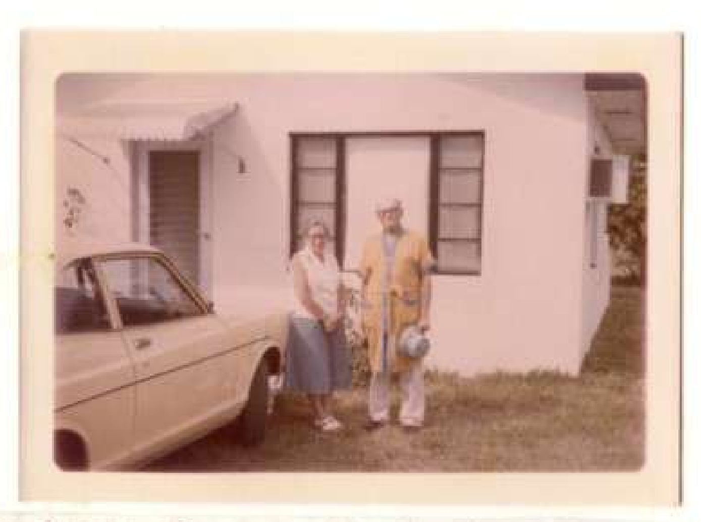
In front of our cabin in Warm Mineral Springs in Florida, April 1977.