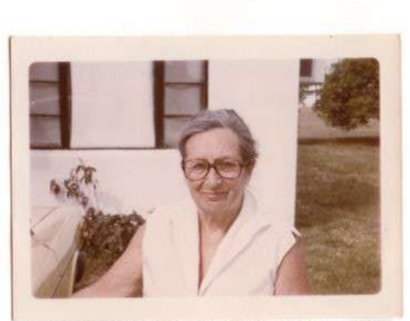
Warm Mineral Springs, Apr.1977