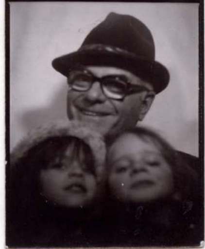
Oct. 30, 1971