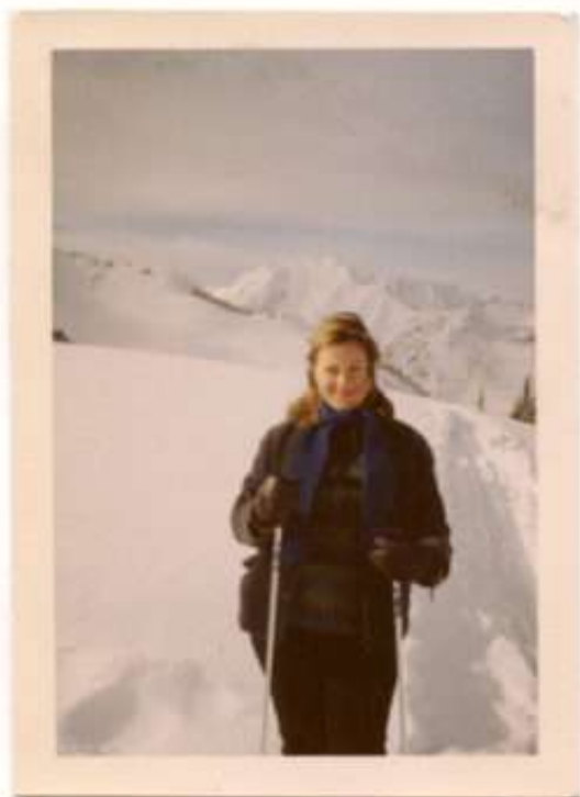
Alta, Utah. Dec. 1968