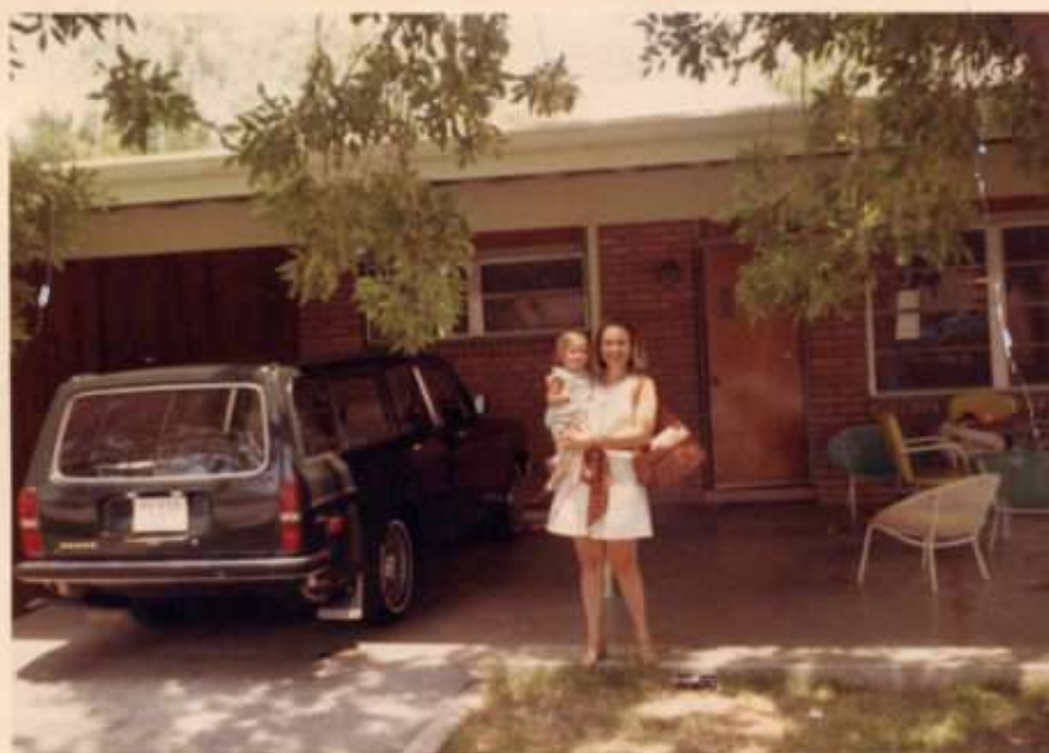
San Antonio, Texas. July 69.