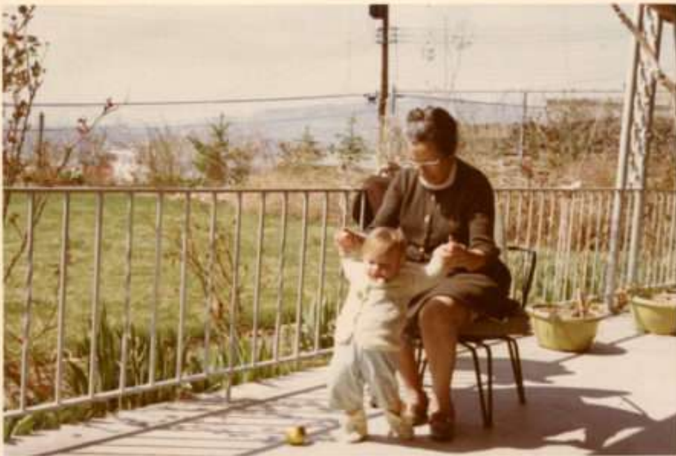
Salt Lake City.