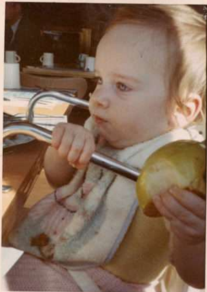
Brighton, Utah. March 1969.