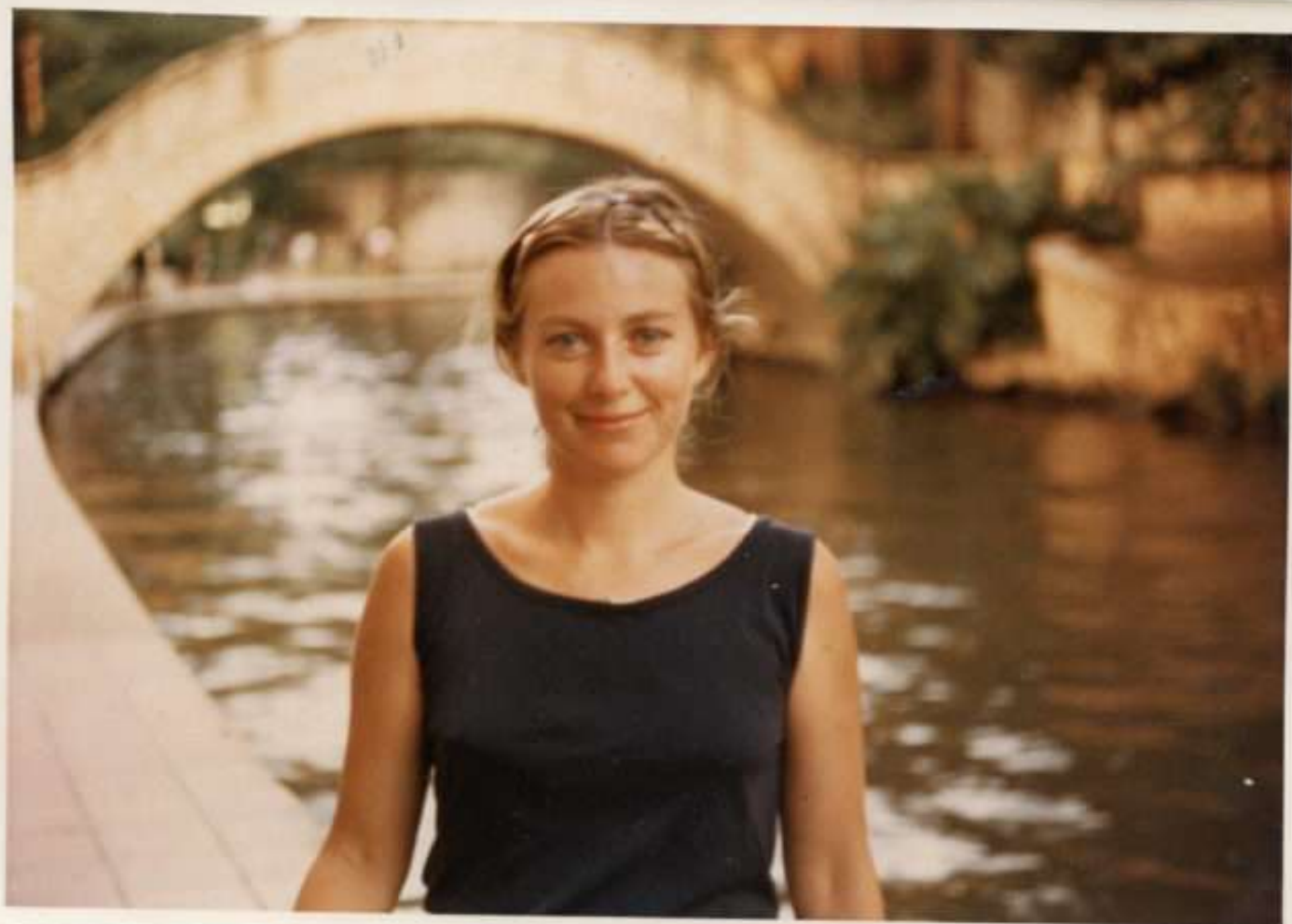
San Antonio, Texas. July, 1969.