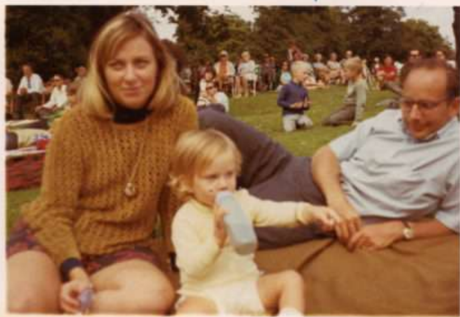
In Sun Valley, Idaho.