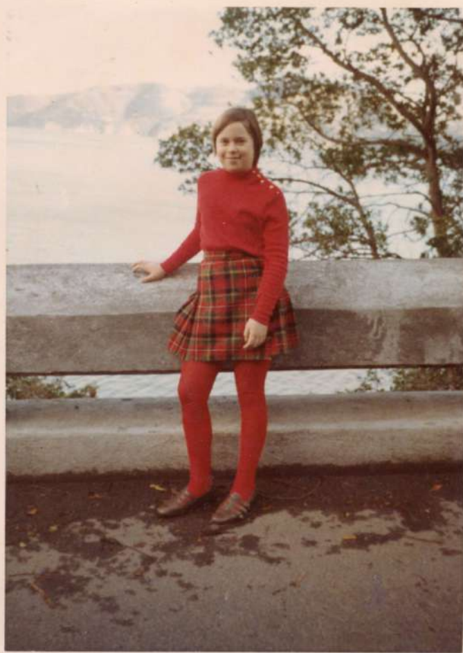
San Antonio, Texas, July 1969.