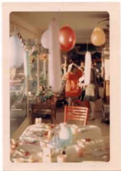
Dec. 17, 1968