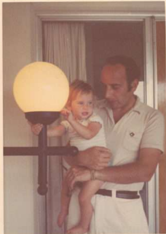
Acapulco, Mexico. July 1969.