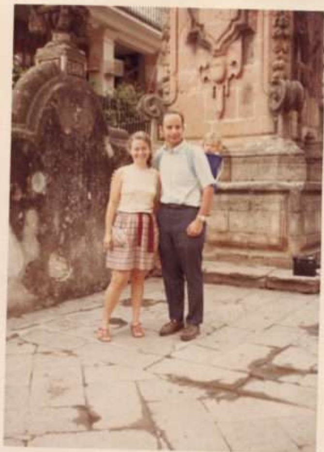
June 1969, Mexico.