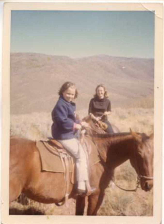
Oct. 1968. Salt Lake City, Utah.