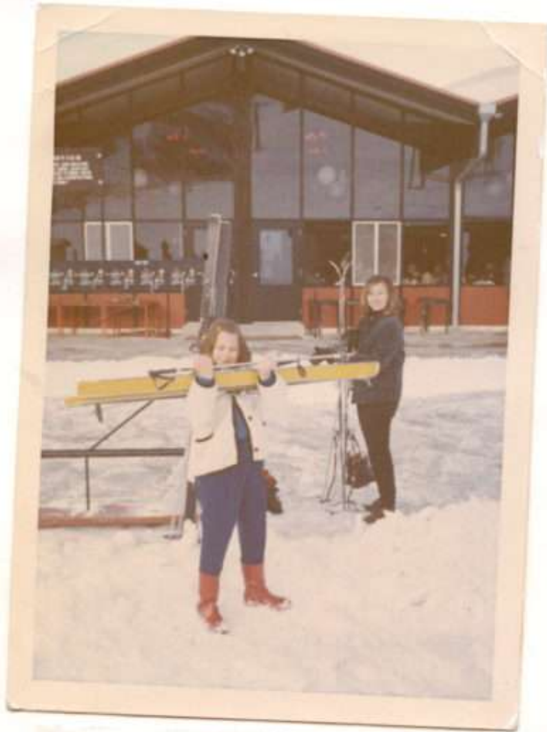
Park City Ski Lodge, Dec. 1967