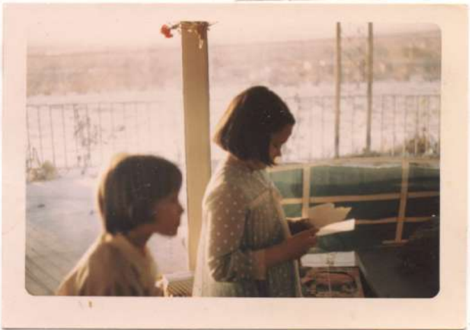
12/17/68 Dec. 17, 1968