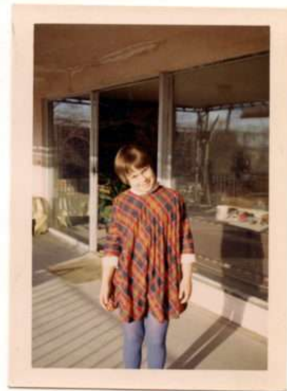
Febr. 20, 1968