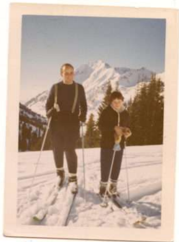
Alta, Utah, Jan. 1968.