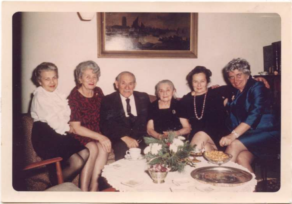
Dec. 30, 1968