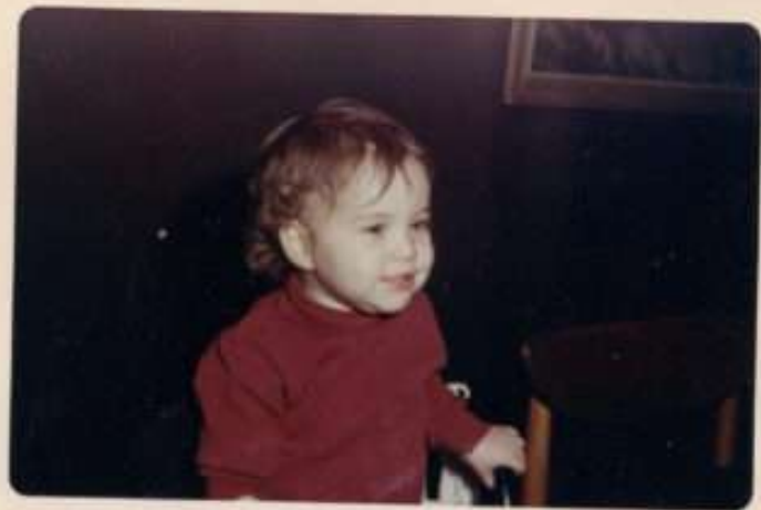
March 16, 1968