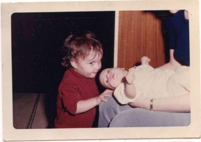
March 13, 1968