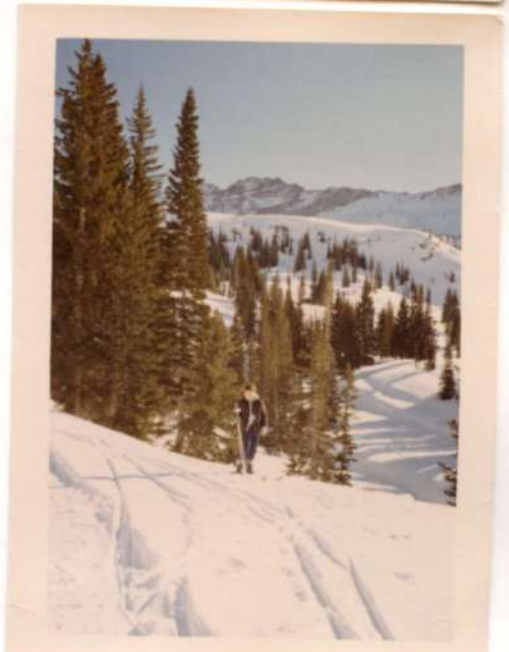
Jan. 1968. Skiing at Alta, Utah.