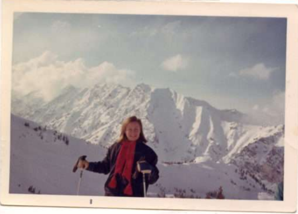
Dec. 1968. Alta, Utah.