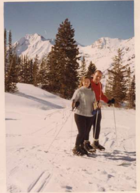
Alta. Jan. 1968