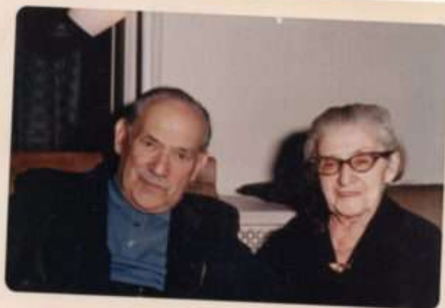
March 13, 1968.