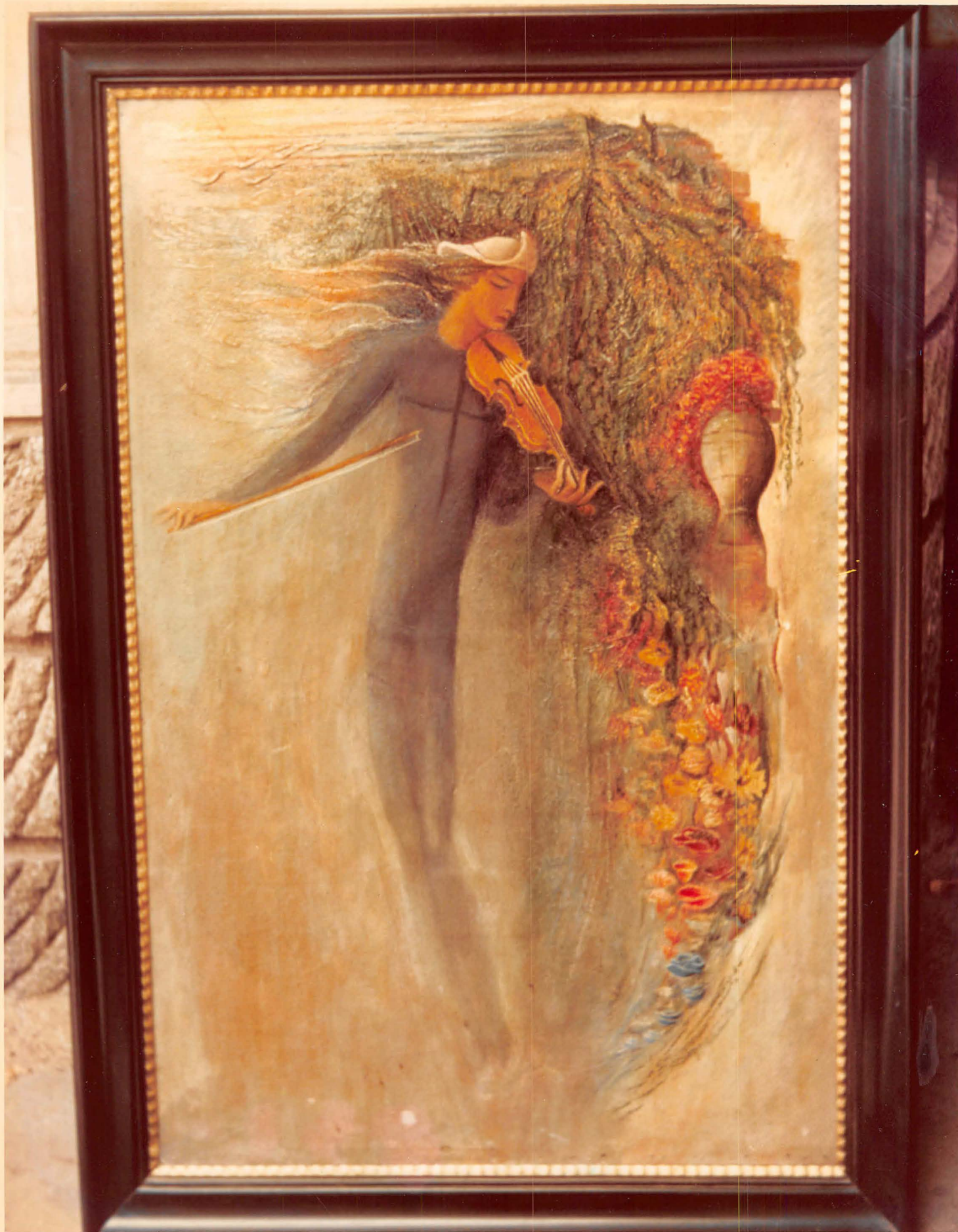
Music angel. Oil on canvas. ca 29 in. x 36 in. Not signed. Else's last painting.