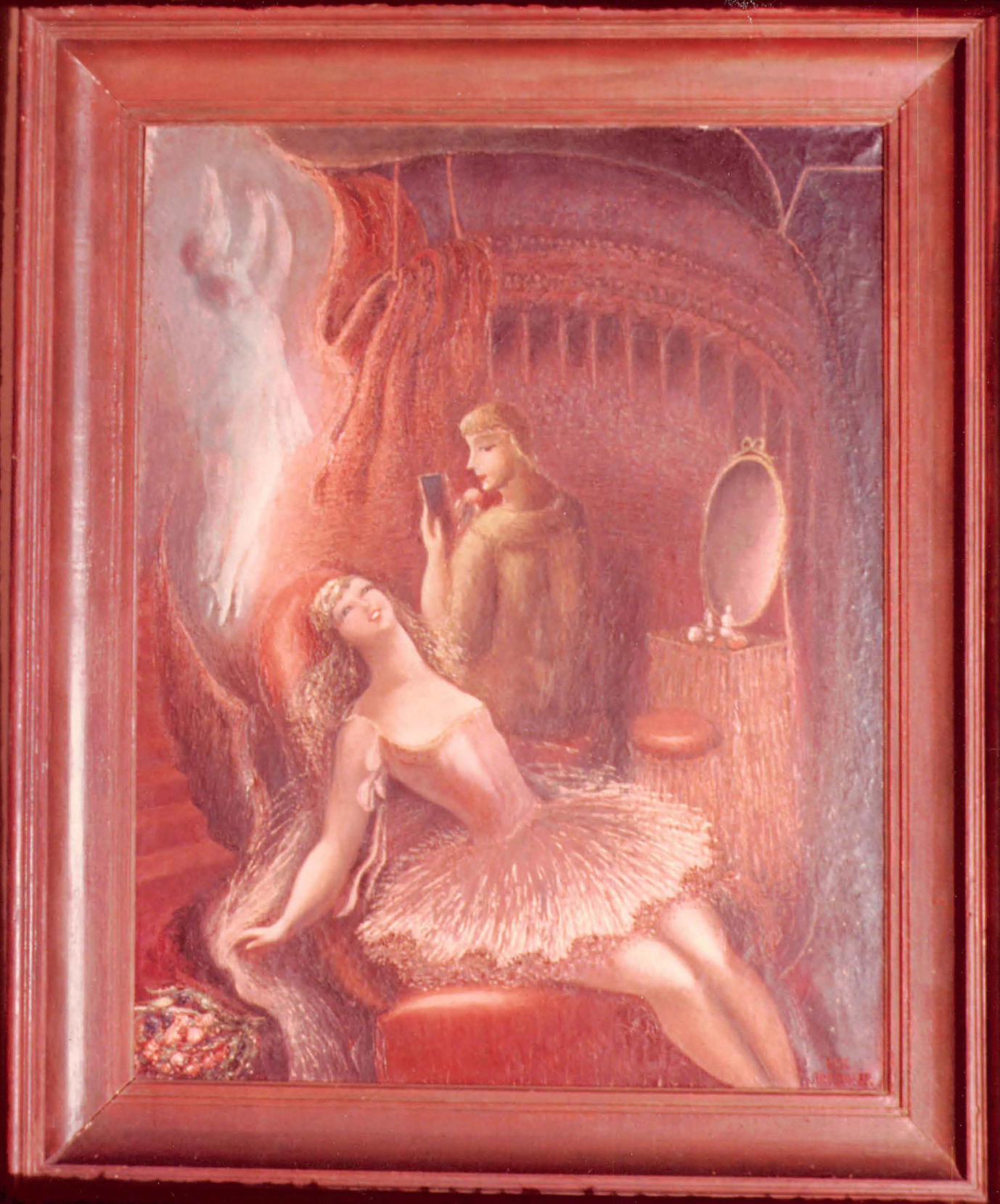
9. Danseuse hallucinée. (The hallucinating dancer) Oil on canvas. 29 in. x 36 in. Signed ELSE MECHNER.