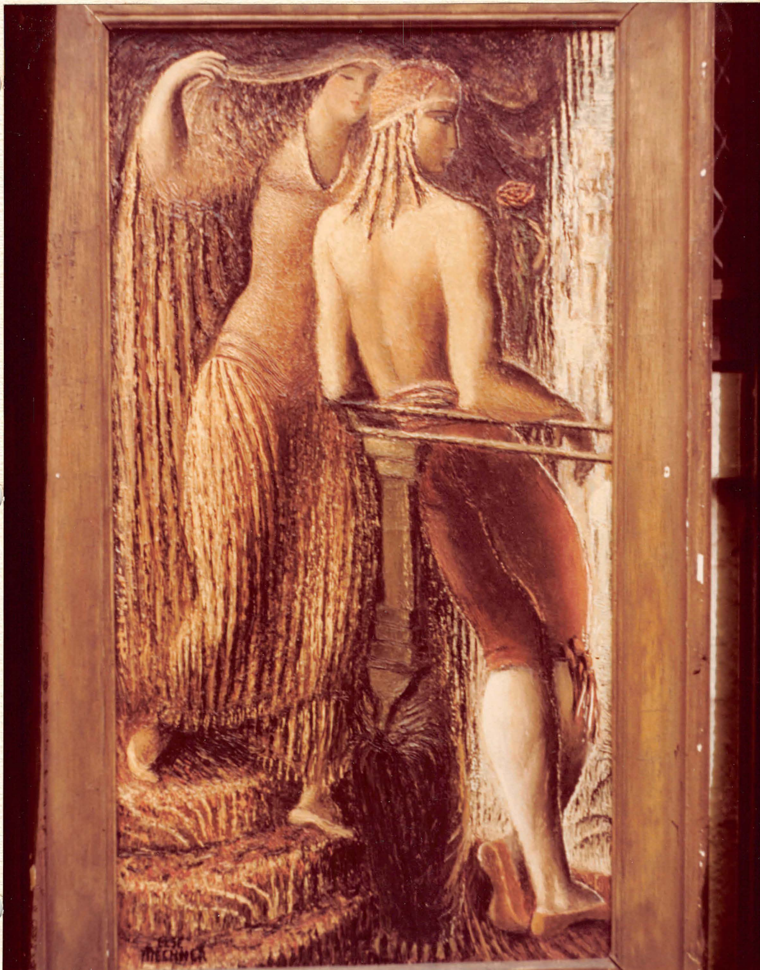
5. Le Prince. (The title could also be: Samson and Dalilah. Oil on canvas. 32 in x 18 in.) Signed ELSE MECHNER.