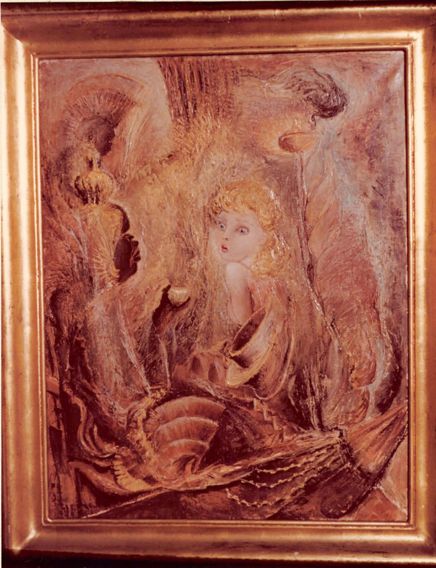
1. La petite Fille chez la Sorcière. (The little girl at the sorceress. Oil on Canvas. 29 in. x 36 in. Signed ELSE MECHNER.