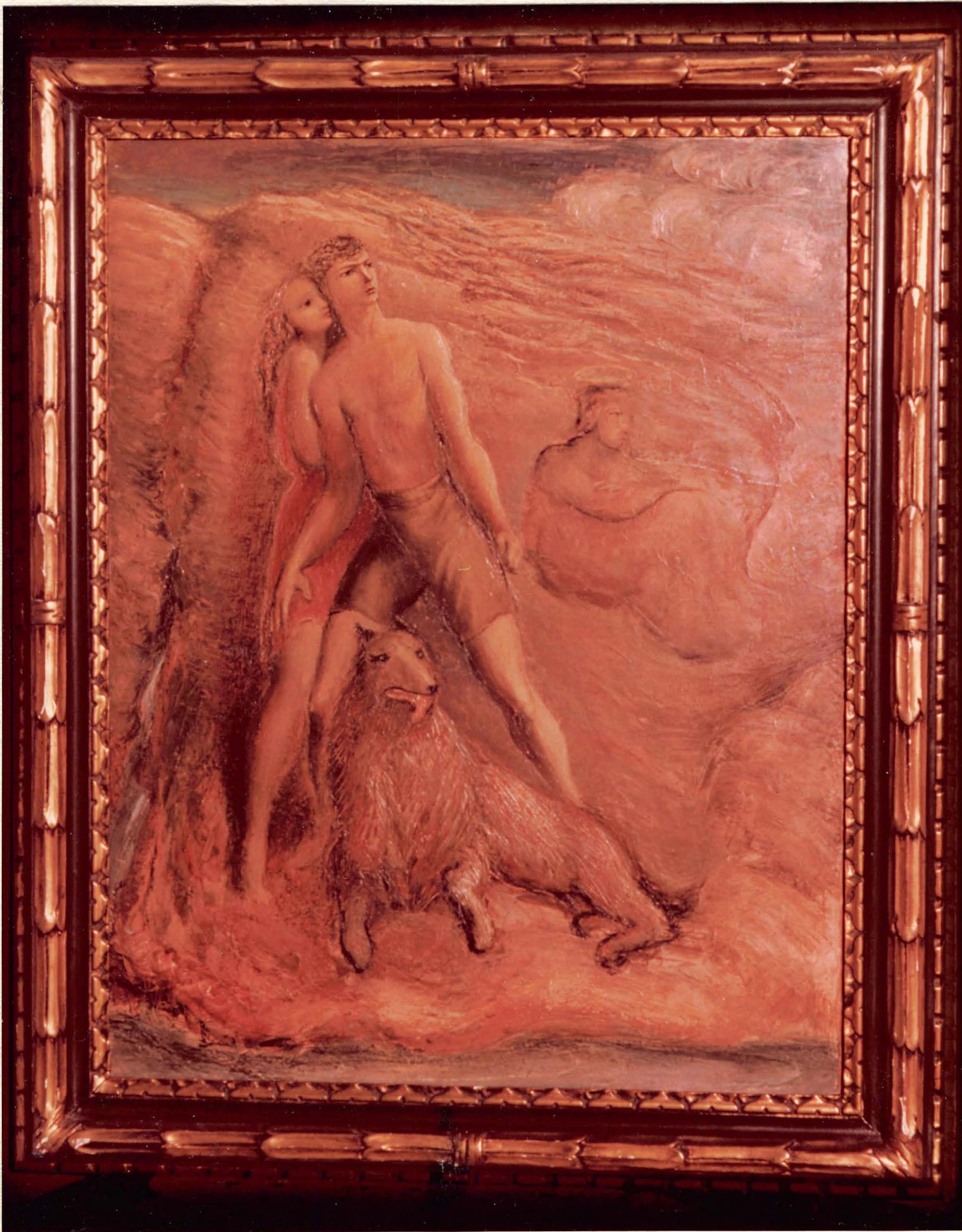
4. Saint au Paysage. (The title could also be: Tobias, Sarah, and Gabriel) See the 'Apocrypha' the book of Tobit. Oil on canvas. 36in. x 28 in. Signed ELSE MECHNER.