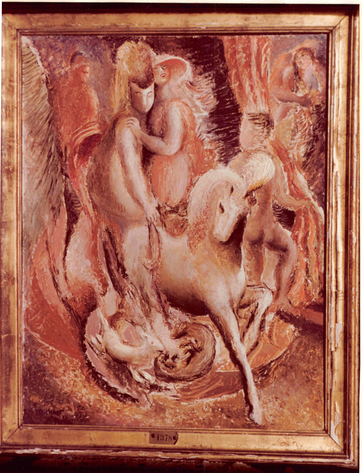
11. Au Cirque : l'Entrée du Cheval (At the circus : Entrance of the steed. ) Oil on canvas. 28½ in. x 36 in. Signed ELSE MECHNER.