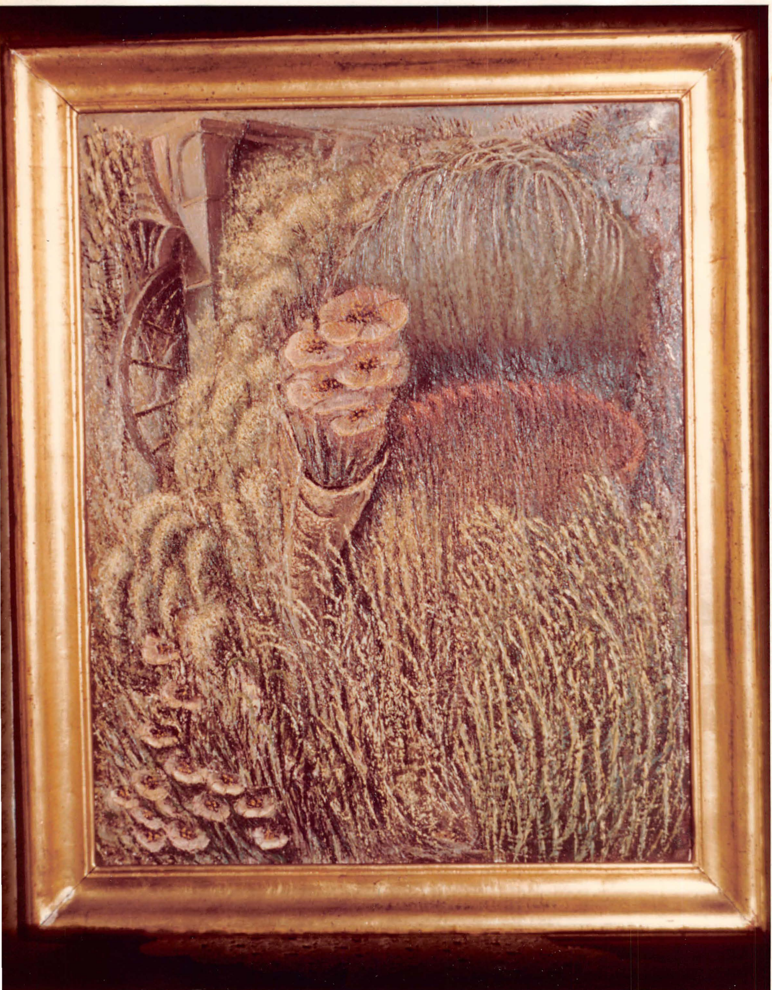
12. Paysage printanier. (Spring landscape). Oil on canvas. 31½ in. x 39 in. Signed ELSE MECHNER.