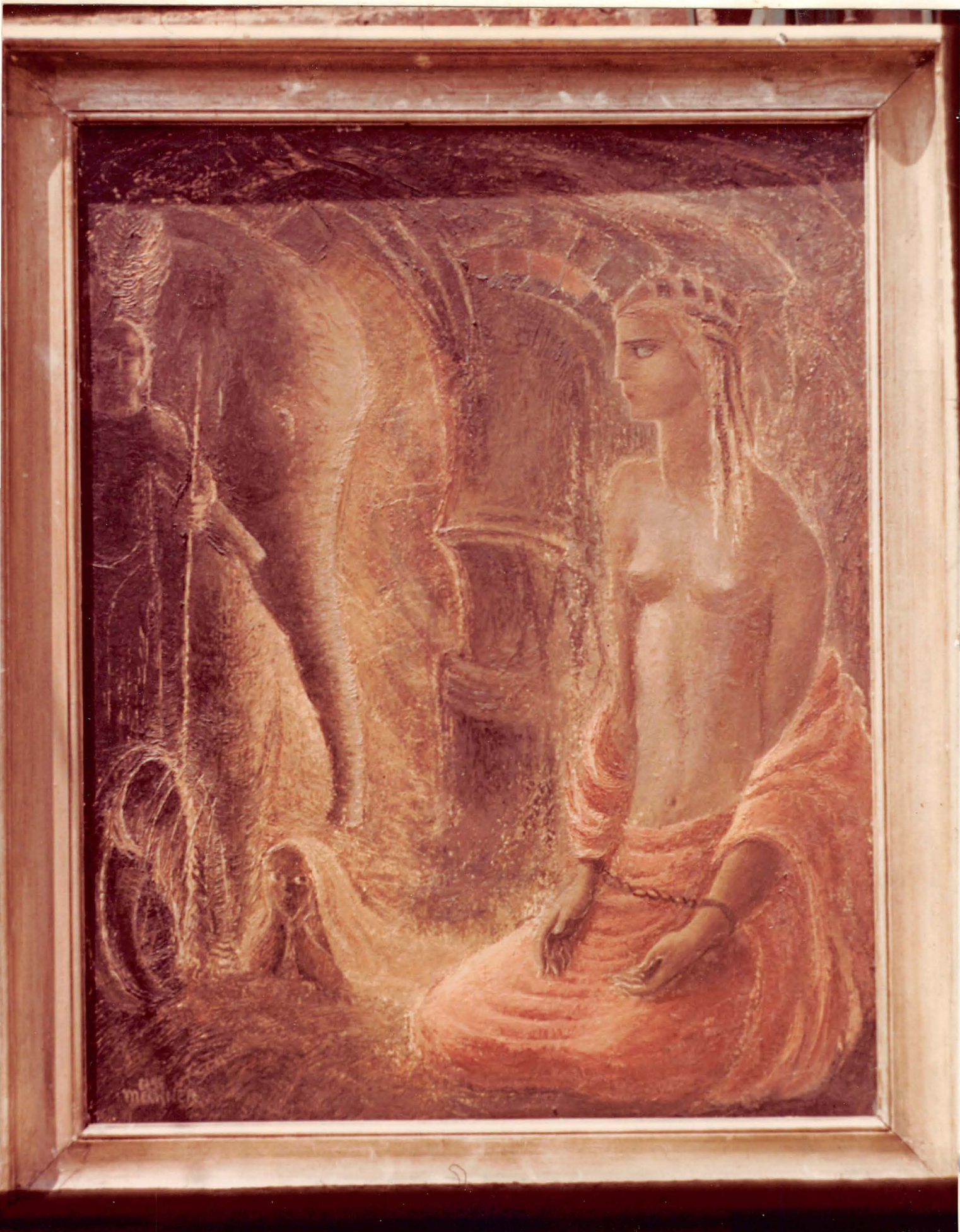
8. La Prisionnere. (The Prisoner). Oil on canvas. 32 in. x 39 in. Signed ELSE MECHNER.