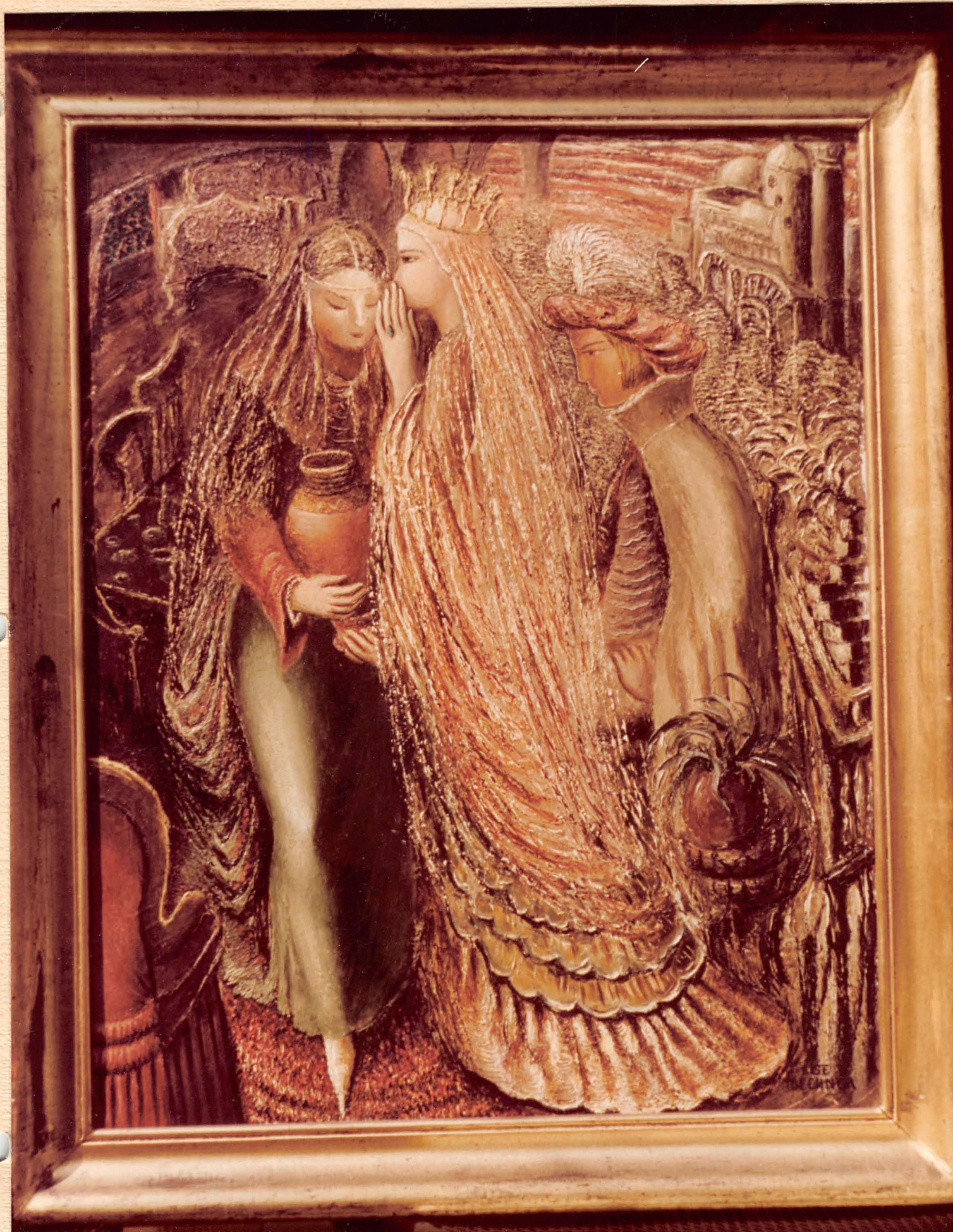
2. La Confiance d'une Reine. (The trust of a queen). Oil on canvas. 32 in x 39½ in. Signed ELSE MECHNER.