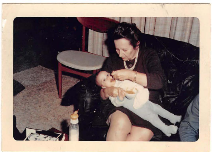
Jan. 29, 1967